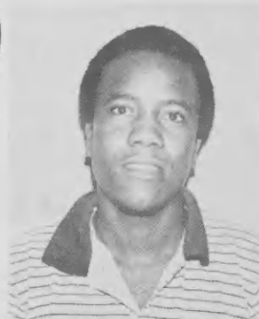
Serio Romney Mechanical